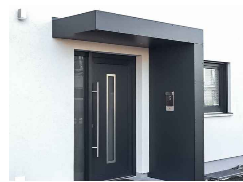
Grey clad cantilevered canopy.

© McCarthy & Stone Retirement Lifestyles Limited All rights reserved. The reproduction of all or any part of this drawing/document and/or construction of any building or part of a building or structure to which this drawing/document relates without the written permission of the copyright owner is prohibited.